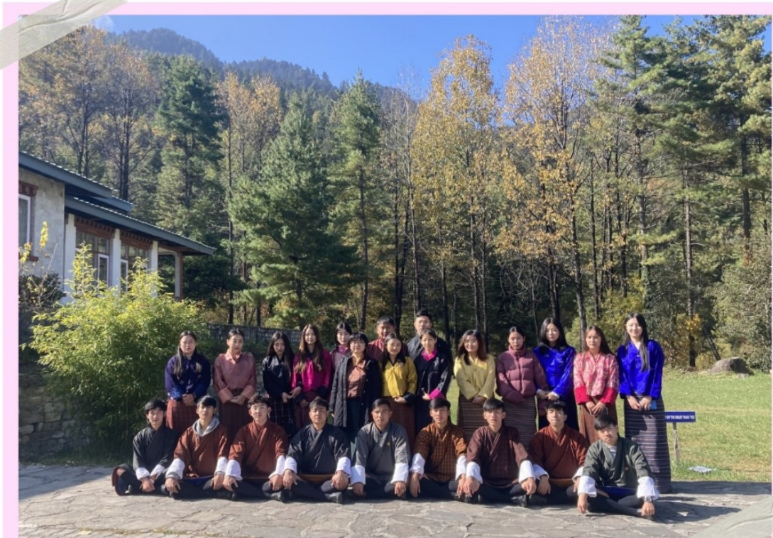
2021 anthropology cohort