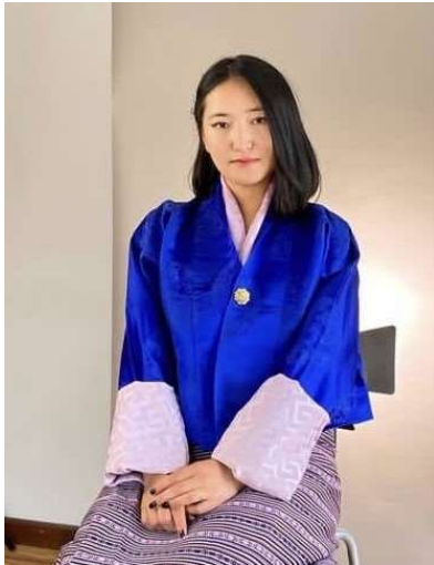
Anthropology 2021 graduate