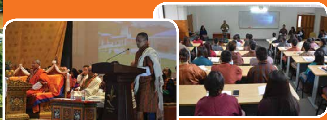
An Aerial View of the College Campus

Come and discover your best, do your best and live your best!