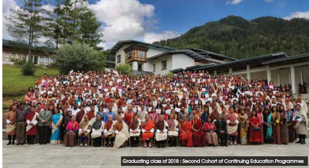
Graduating class of 2018 : Second Cohort of Continuing Education Programmes

Candidates can directly apply online at www.rtc.bt . A one-time refundable security deposit of Nu. 5,000 will be charged and refunded to students upon their departure from the College if there are no outstanding payments.