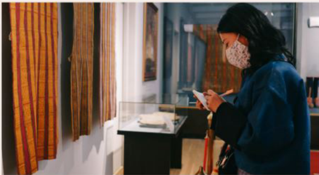
Student Journal of the Anthropology Programme, Royal Thimphu College