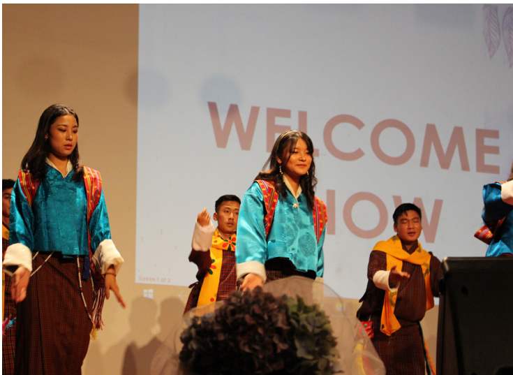
Welcome Show August 18, 2021