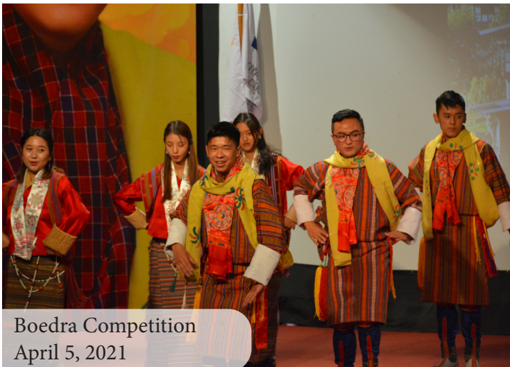
Boedra Competition April 5, 2021