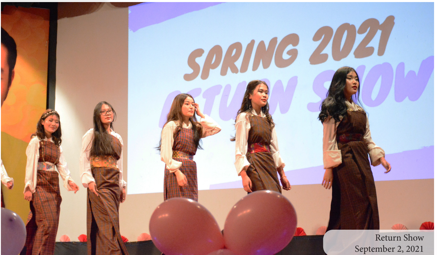
Return Show September 2, 2021