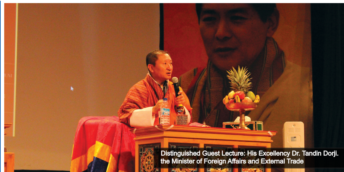
Distinguished Guest Lecture: His Excellency Dr. Tandin Dorji, the Minister of Foreign Affairs and External Trade